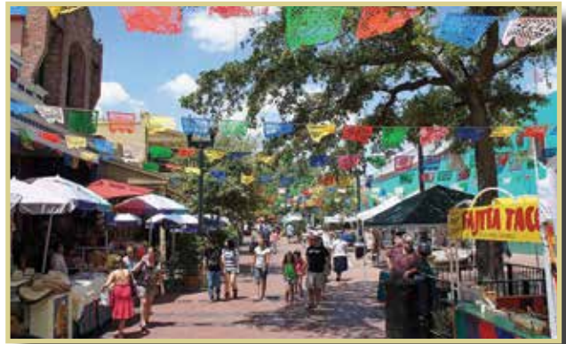
San Antonio Market Square

Whether you are an experienced forensic expert or aspiring to be one, come on down to the ABVE Conference in San Antonio. Speakers will cover a wide range of topics, from running a successful business to honing your skills and learning about new developments in forensic practice. Here is a sampling of the presentations.