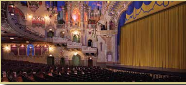
Majestic Theatre – San Antonio, Texas